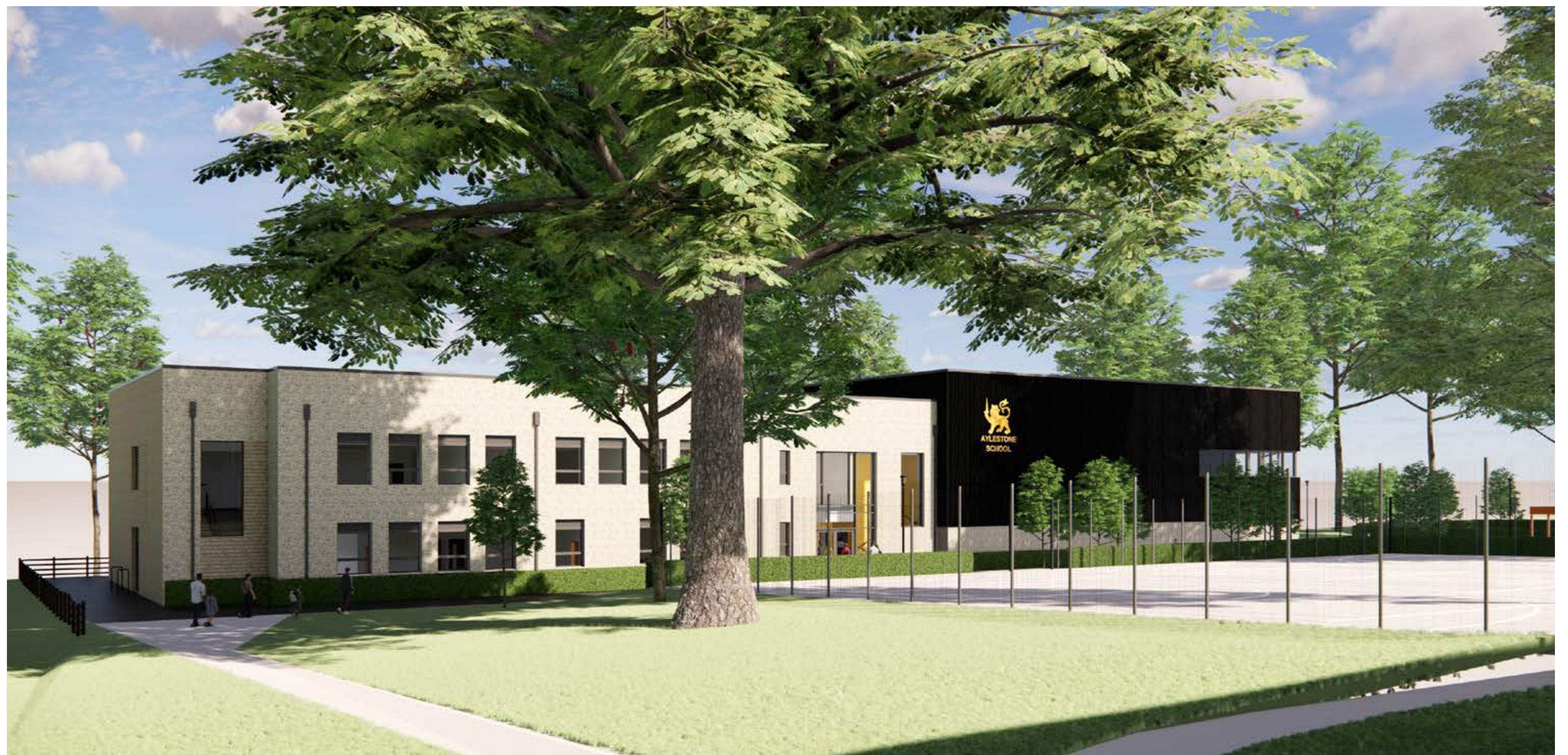
View from Main School Building towards new building

Sloped paths bring students and visitors to the central main entrance of the new building from Broadlands House and the main building. Steps give direct access to the hard court games area (MUGA).